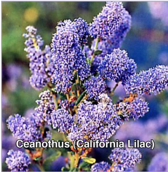
Ceanothus (California Lilac)